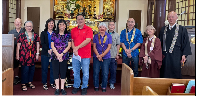
Installed Officers (1-14-24):

All temples in the state, and Waipahu is no exception, face ongoing challenges of declining and aging membership as well increasing operating costs and the need for more volunteers. These critical issues, along with more such as the fate of Lahaina, will be discussed amongst all the lay members and ministers of temples statewide as we navigate forward.