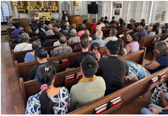
SANGHA DAY @Pearl City Hongwanji March 2, 2025